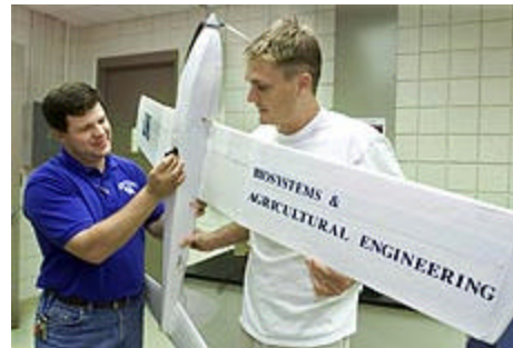
Figure 1. UAV remote sensing platform developed at UK.

A UAV platform for field image acquisition has already been developed (Fig. 1). This platform currently has the capability to carry a small low-resolution board camera and wireless video transmitter. The digital cameras that have been used to collect NIR